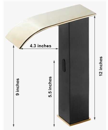
Product shown is only for installation display purpose